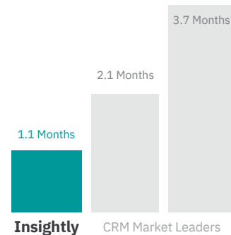
Faster Go Live Time