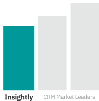
Lower Perceived Price